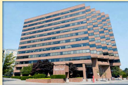
New location of ISHIB headquarters in Arlington, Virginia.